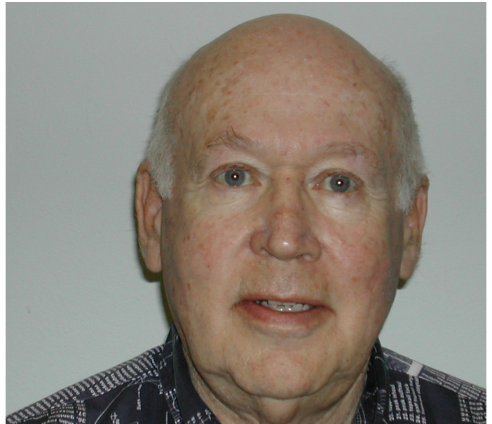
Bulletin writer: Gerry Herrmann

to open in 2014. $1,100,000 million will be invested in the park. 800 fire hydrants or trees will be planted. Dick Braun also wanted them to be sure and have a good supply of doggy bags. Across the street from the dog park will be an area used by SPCA with a place to see and adopt pets. 13,000 to 14,000 animals were brought to the shelter in 2012. Adoptable dogs are not put down. Last year 6153 were adopted, including about 1500 cats. (If you missed the meeting, 50 Frisbees were also passed out)